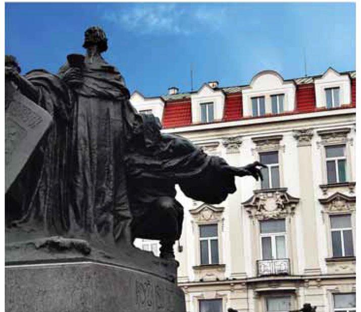
2 GO AROUND THE STATUE