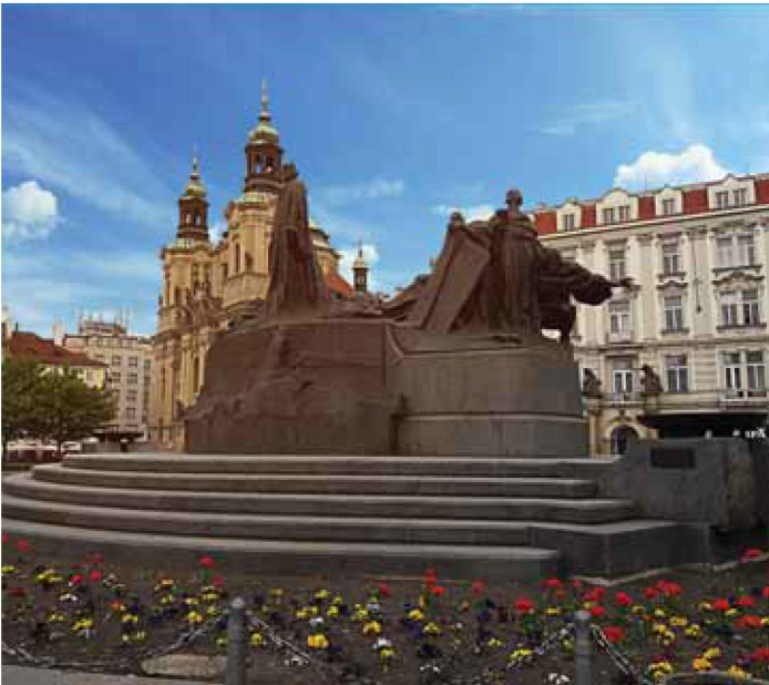
1 LOCATE THE STATUE IN THE MIDDLE OF THE SQUARE

IS ABOUT 5 MINUTES WALK FROM METRO STATION “ STAROMĚSTSKÁ ” ON THE GREEN “ A ” LINE, OR FROM “ NÁMĚSTÍ REPUBLIKY ” ON THE YELLOW “ B ” LINE.