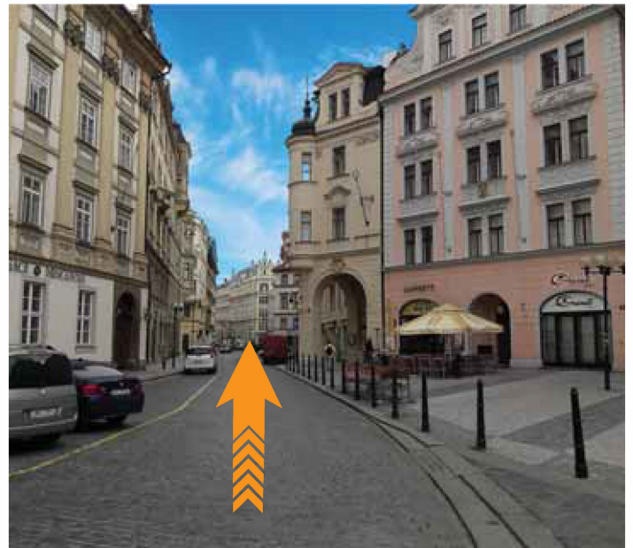
4 YOU WILL GET ON THE STREET NAME “ DLOUHÁ ”, CONTINUE DOWN THIS STREET ABOUT 50 METERS